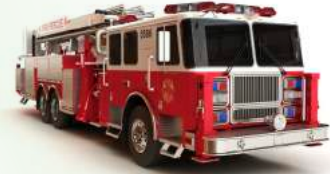
Municipal Safety Designed to be dependable even with intermittent heavy use.