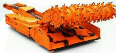
Mining & Construction Proven durability in high shock and vibration environments.