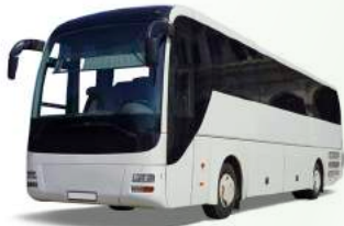
Specialty Vehicles Handles powerful wash downs.