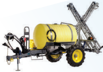
Agricultural Dependable performance in unique chemical exposures.