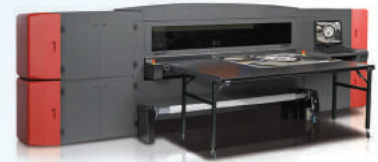
Printing Small footprint, lets XLS-1 easily fit into existing systems.