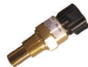
ETS Series Temperature Sensors