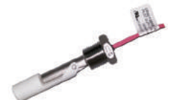
LS-7 Float Reed Switch