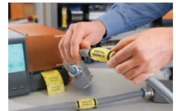
Cable Jacket Markers