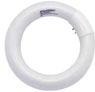
Nominal diameter : 12 in. (305 mm) Dia. : 1 3/16 in. (30 mm)

Order code: 58986 Description: FC12T9/CW/RS/4P/STD UPC: 69549589865 Case quantity: 24