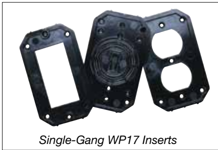
Single-Gang WP17 Inserts