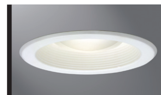
5001P White Trim, White Baffle