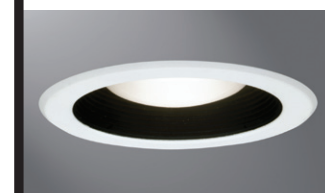
5001MB White Trim, Black Baffle