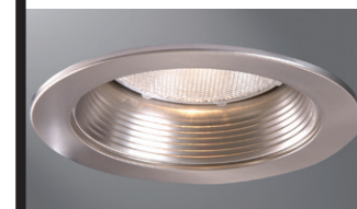
5001SN Satin Nickel Trim, Satin Nickel Baffle