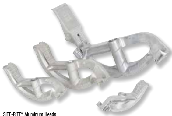
SITE-RITE® Aluminum Heads 840A, 841A, 842A, 843A