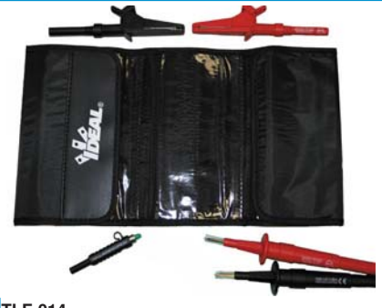
TLF-014 CAT IV Custom Kit Kit contains: 1kV Cat IV Probes with Shuttered Spike, 1kV Alligator Clips, Lead/Fuse Tester and Four-Pocket Tool Roll Organizer