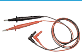
TLF-002 1000V CAT III Leads with large angle plug