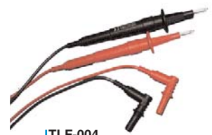
TLF-004 1000V CAT IV Leads