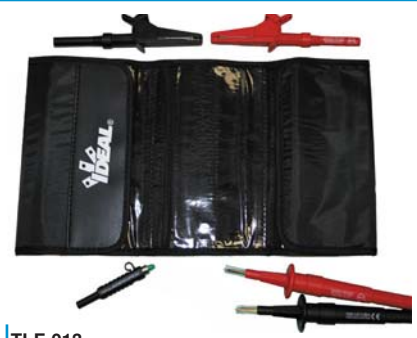
TLF-013 CAT III Custom Kit Kit contains: 1kV Cat III Probes with Shuttered Spike, 1kV Alligator Clips, Lead/Fuse Tester and Four-Pocket Tool Roll Organizer