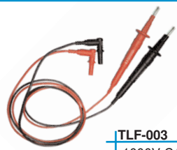
TLF-003 1000V CAT III Leads