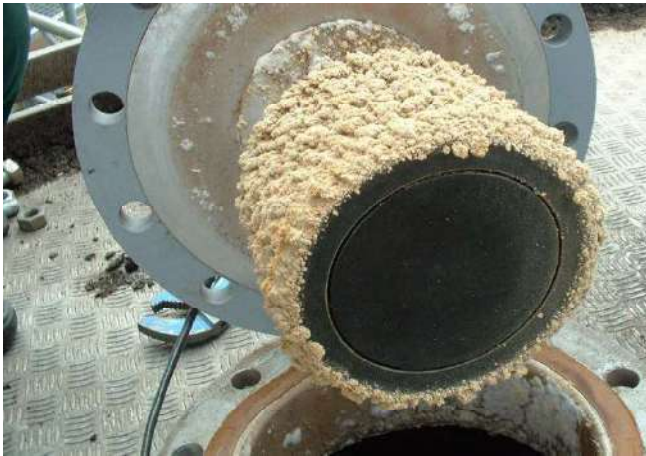
Mechanical vibration keeps transducer face clean