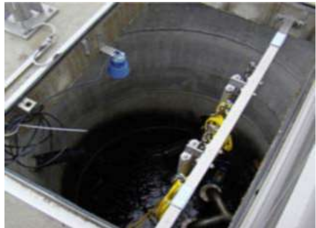
Hermetically sealed transducer is impervious to chemical or moisture ingress

The utilization of any level device regardless of technology designed merely to monitor level yields nothing more than the level measurement. Anything else will have to be characterized. For example, when a level transmitter is used for open channel flow, the flow is usually characterized via head versus flow values that