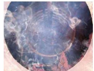
Vaporous and high temperatures are common in the industrial market

All of this makes radar technology very attractive to apply across all industries but their liberal application can undermine the benefits offered by ultrasonic transmitters and controllers, and it can introduce a higher cost of ownership. For example, in some cases, radar transmitters are applied in applications where even some end-users consider the choice an overkill solution. This can be easily understood considering that to one extreme, the technology is well-suited for chemical reactors and extremely dusty applications and to the other extreme, it has been oriented toward significantly less aggressive applications like water and sludge level to OCM. Using a one solution fits all approach in the long run can lead to unfavorable consequences.