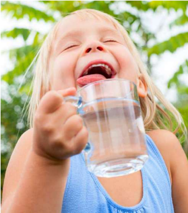
Clean fresh water is not a new thing

If radar can do all of the things mentioned at the beginning of this document, then why is there still a need for other level technologies such as ultrasonic, guided wave radar, laser, pressure, weighing or even gamma rays? All of these technologies have a place where they are best applied in many industries. But, in the water industry, ultrasonic technology is naturally driven as the sound choice by most level and OCM applications.